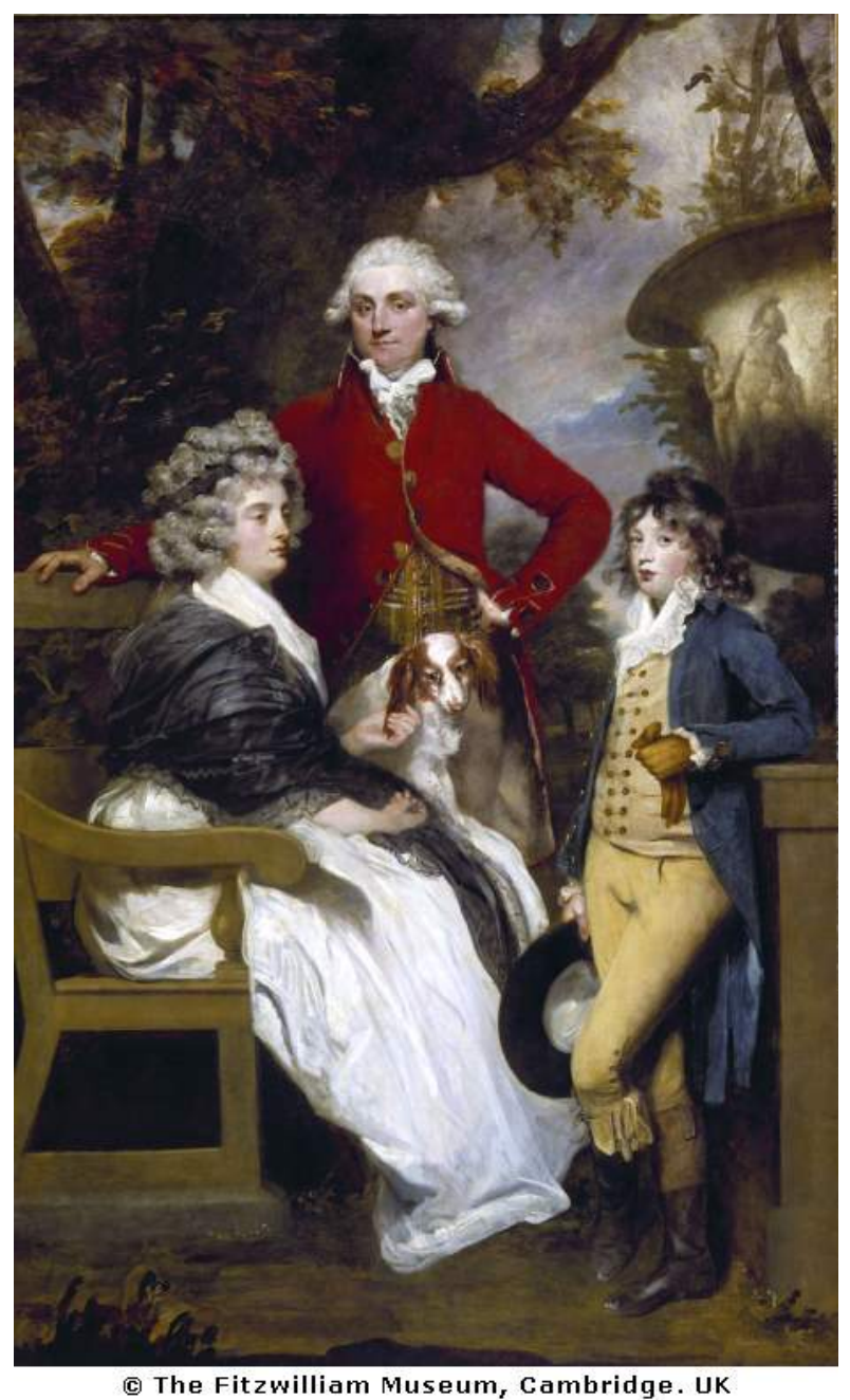
Figure 1.3 The Braddyll family. Sir Joshua Reynolds, 1789.<sup>5</sup>

^5\mbox{Wilson Gale-Braddyll, Member of Parliament and Groom to the Bedchamber of the Prince of Wales.