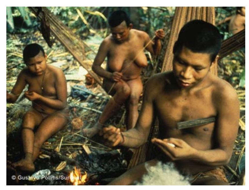
Figure 1.2 The Nukak, a surviving hunter gatherer society in the Colombian rain forest.

limit. That is why there has been plenty of room for African living standards to fall in the years since the Industrial Revolution.